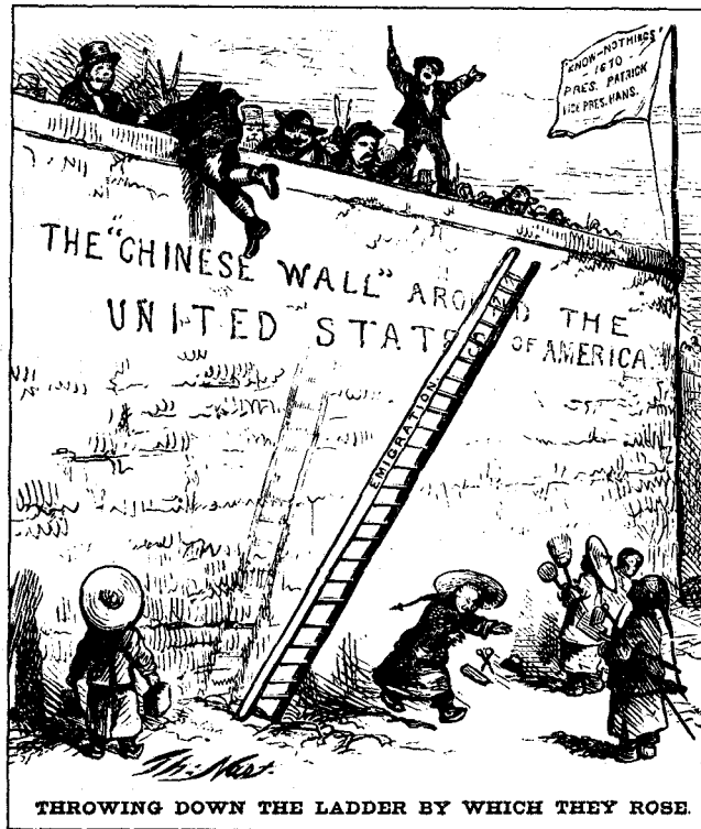
— Thomas Nast, 1870

Base your answers to questions 1666 and 1667 on the cartoon below and your knowledge of U.S. history.